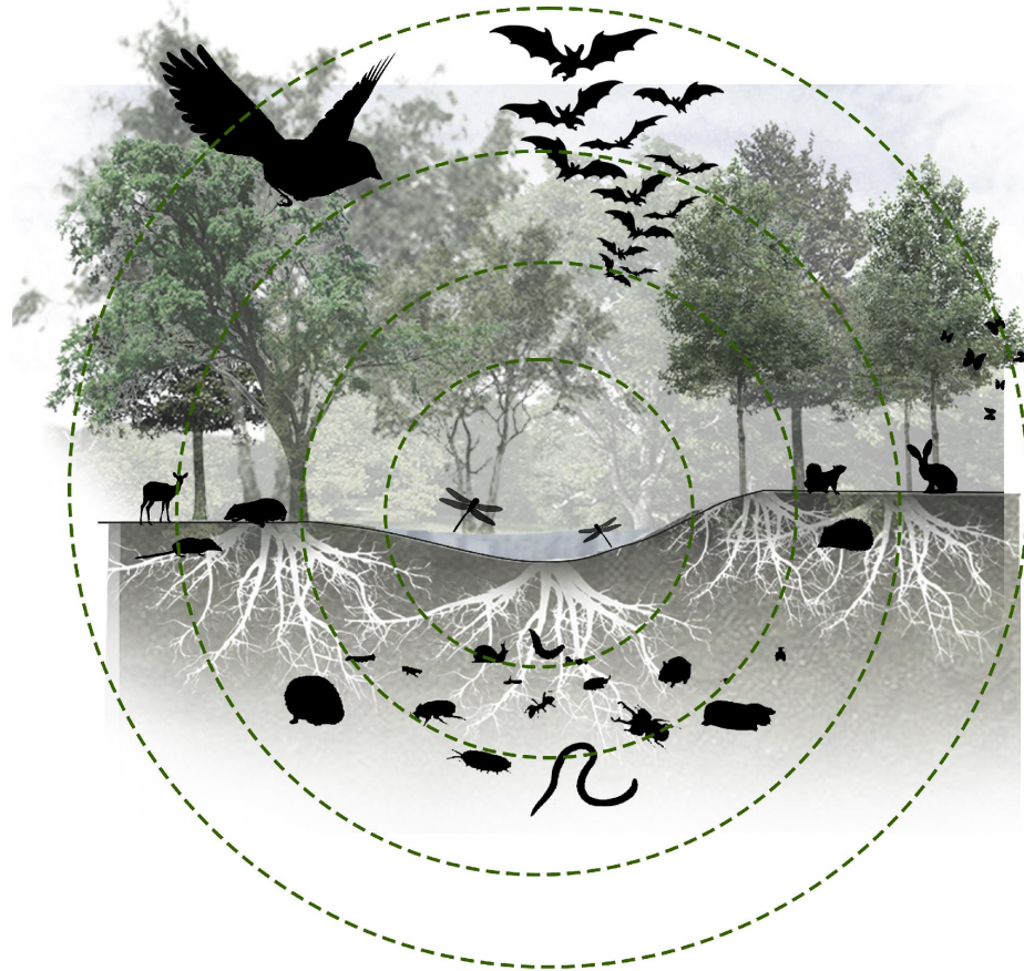
Referece images - Proposed vegetation