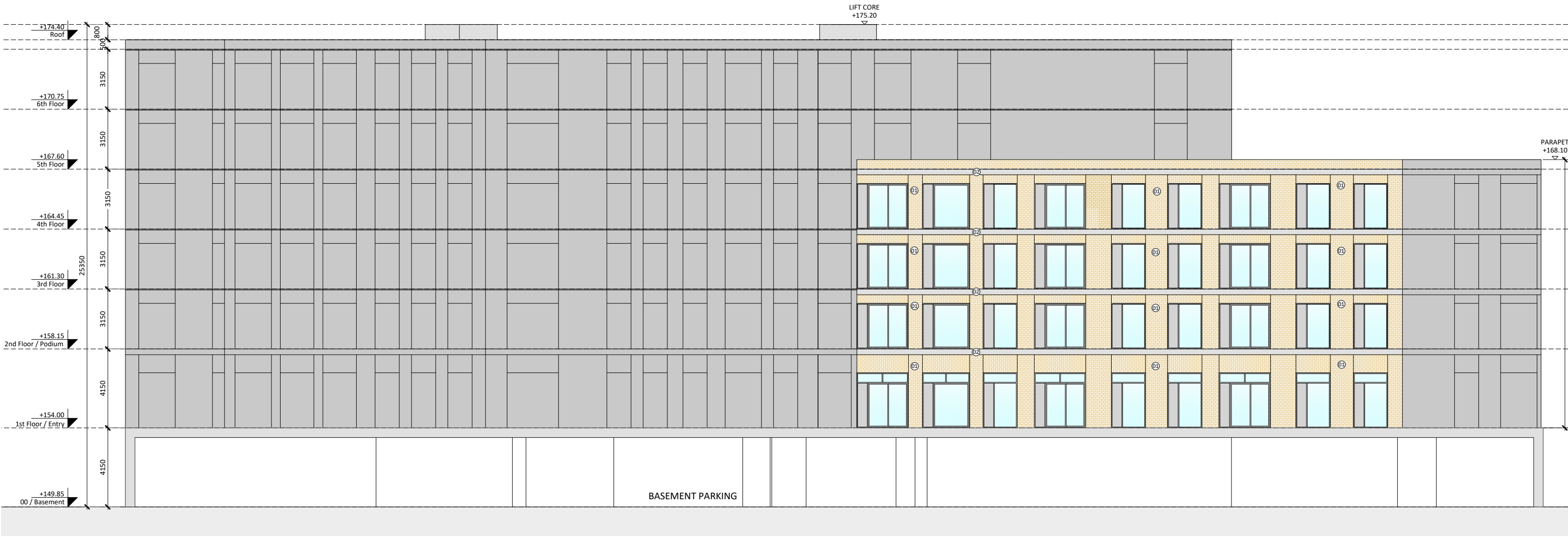
01 — Block C2 - Elevation 03 Scale 1:200