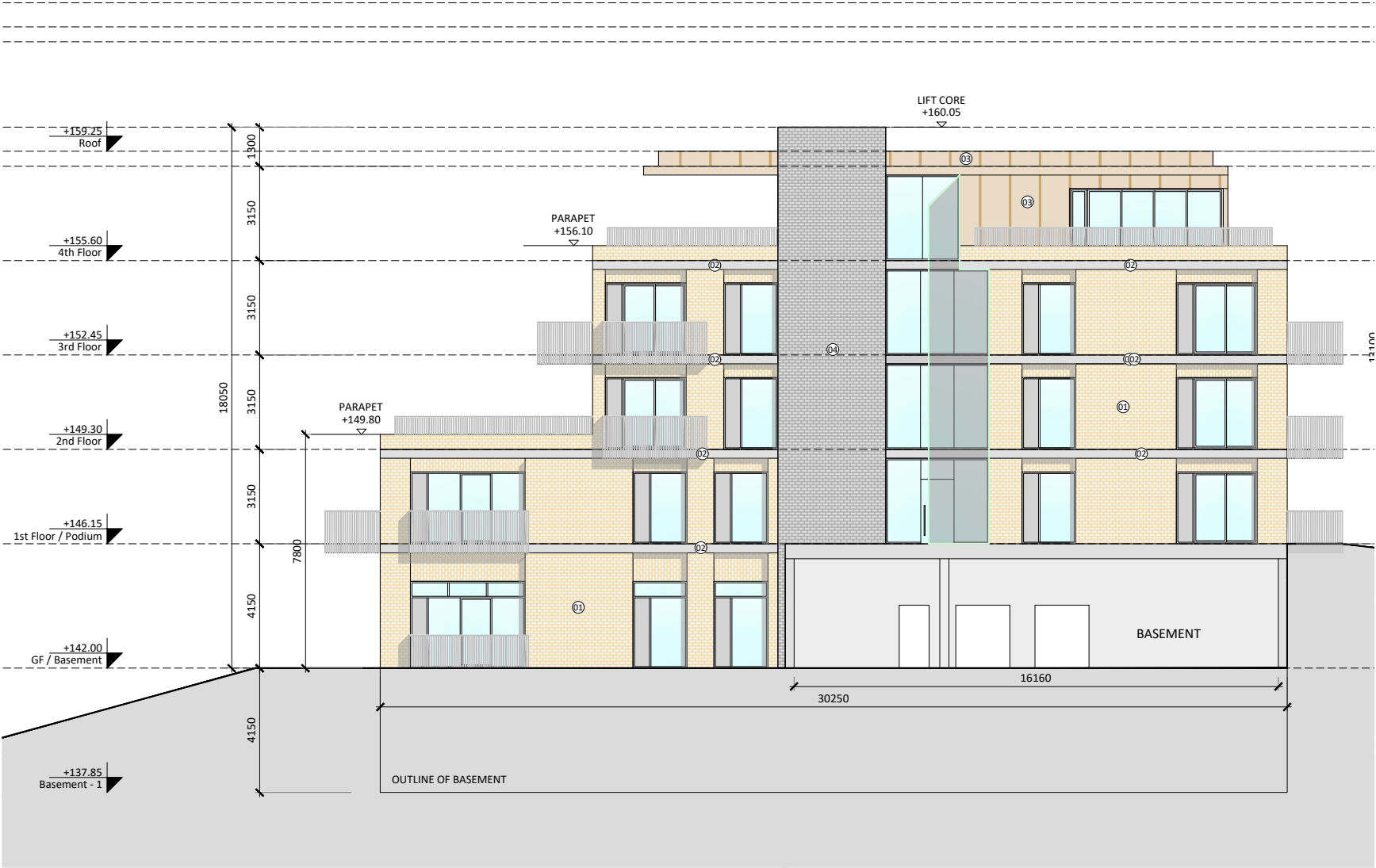
01 — Block B4 - Elevation 03 Scale 1:200