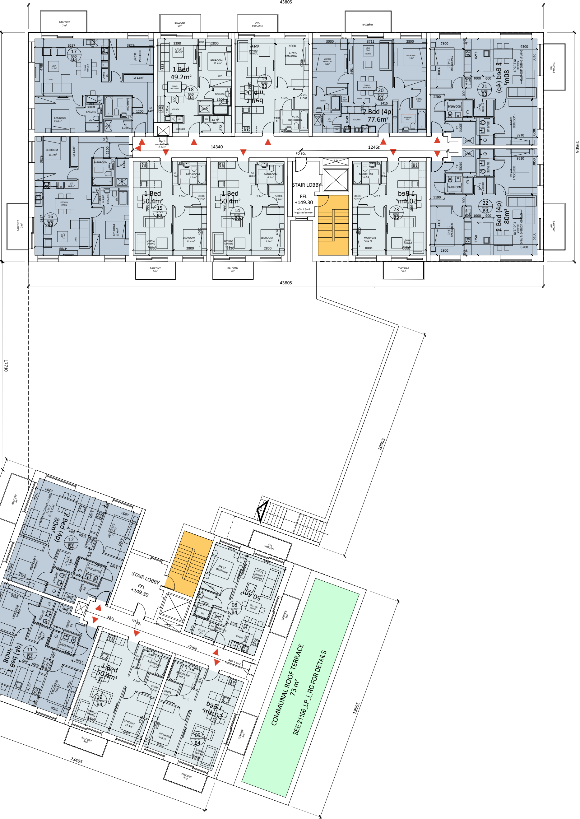
LEVEL 02 (SECOND)