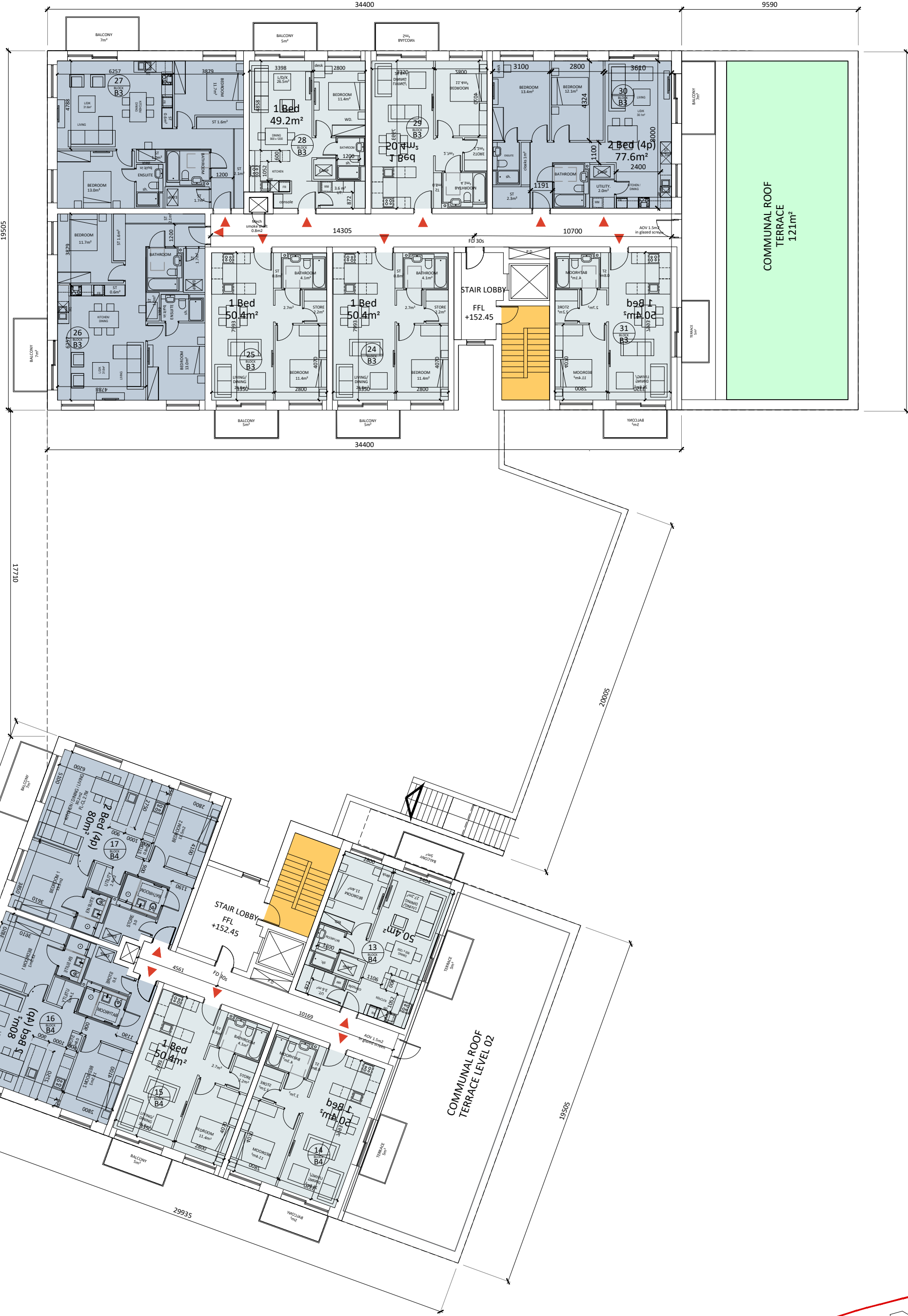
LEVEL 03 (THIRD)