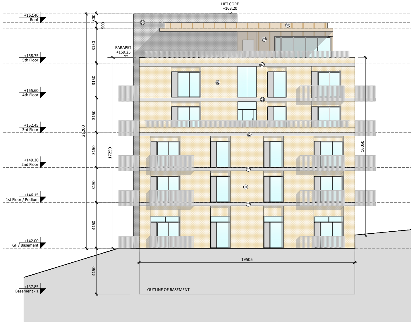
01 Block B3 - Elevation 02 Scale 1:200