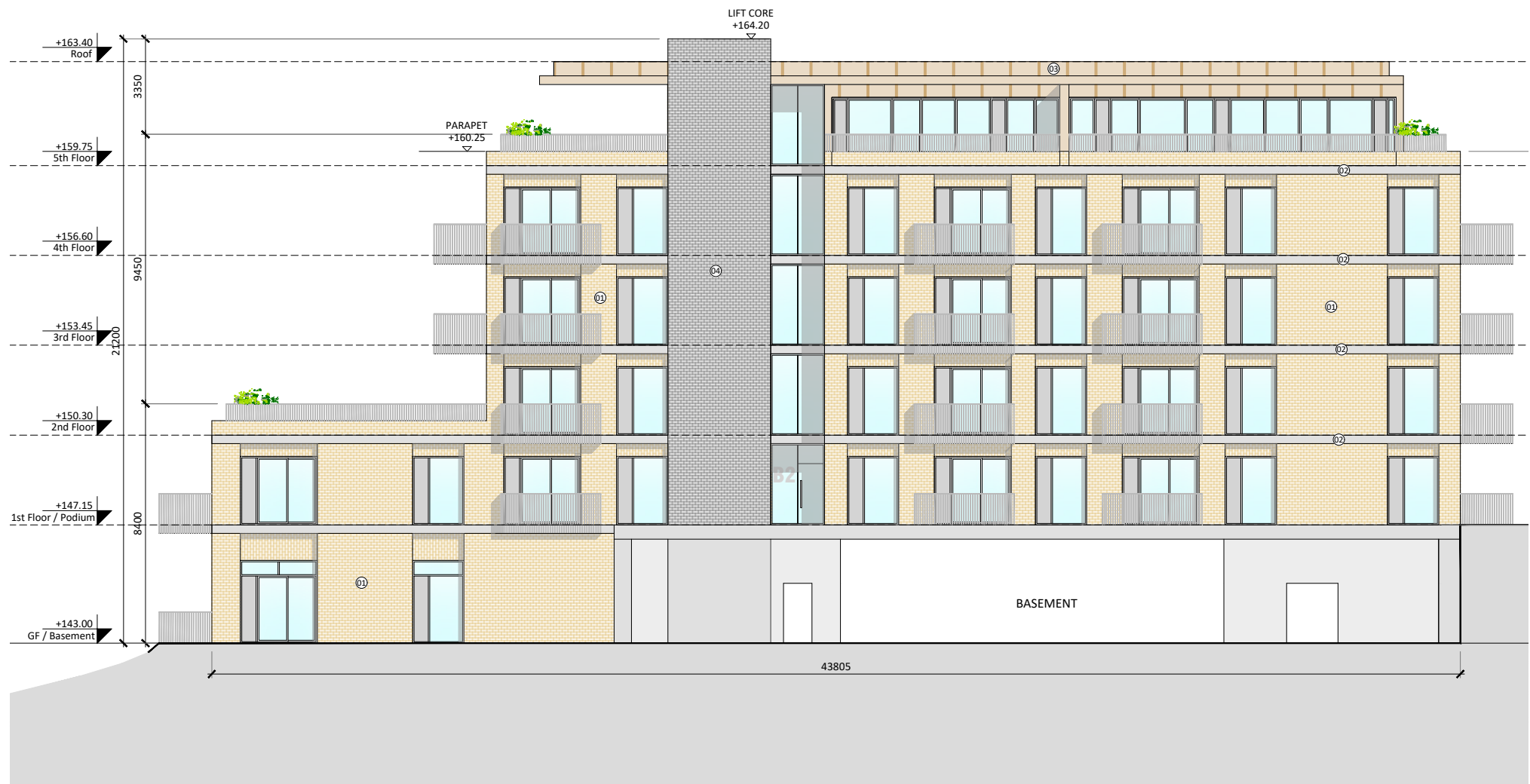
01 — Block B2 - Elevation 03 Scale 1:200