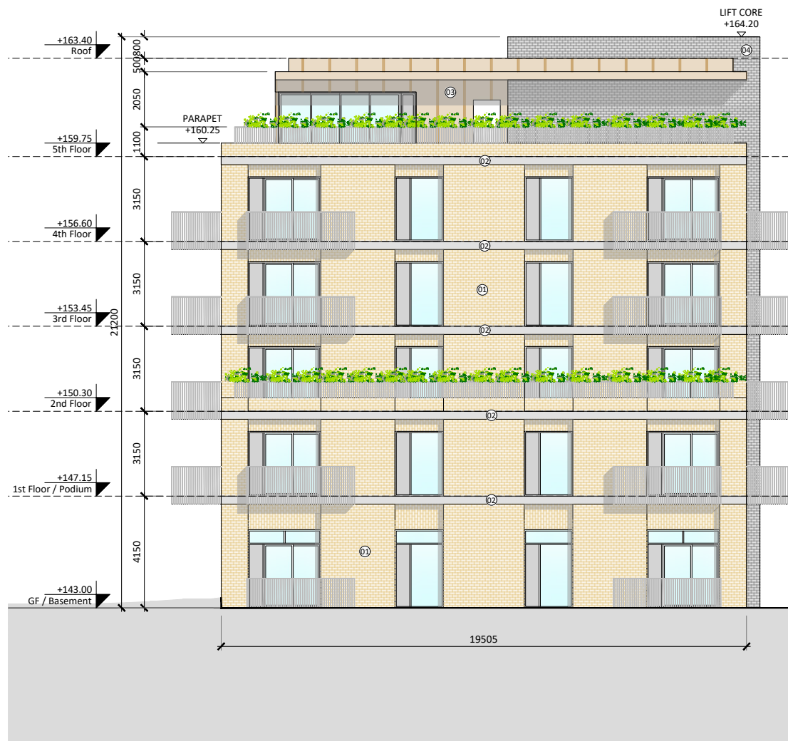
02 — Block B2 - Elevation 02 Scale 1:200