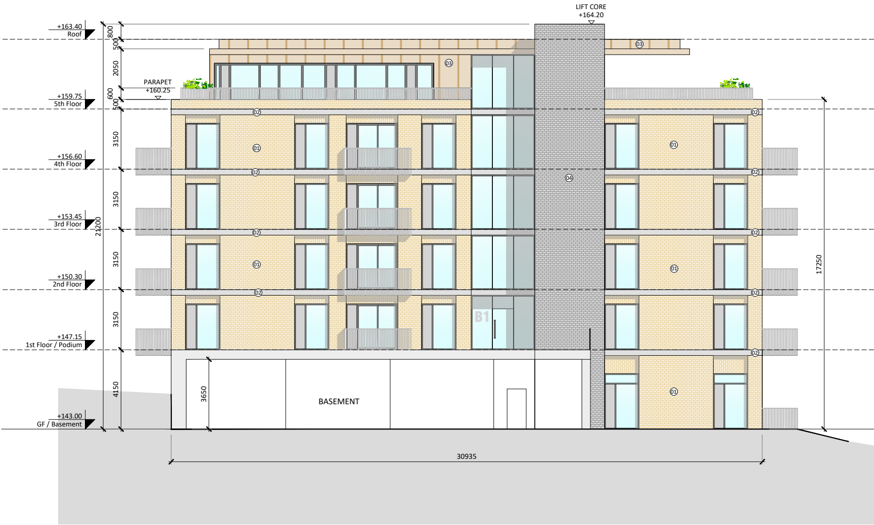
01 — Block B1 - Elevation 01 Scale 1:200