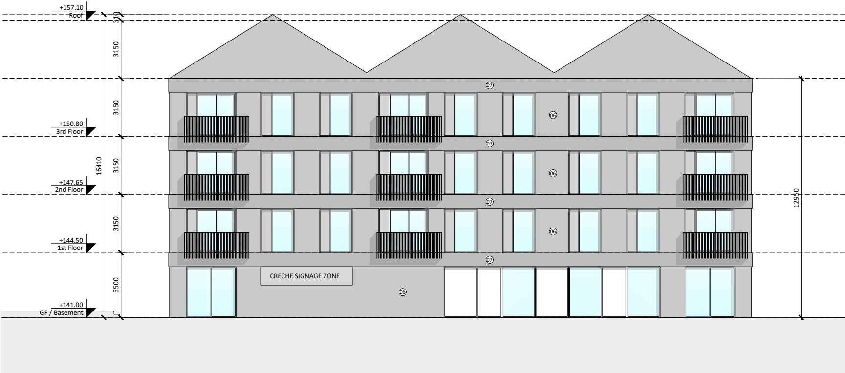
01 Block A1 - Elevation 03 Scale - 1:200